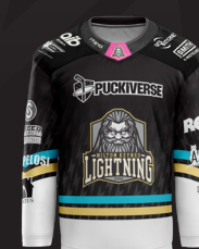
PLAY OFF - DARK