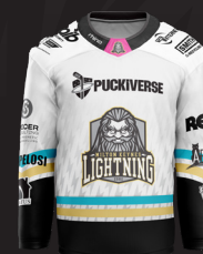
PLAY OFF - LIGHT