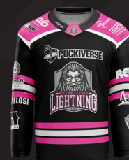
PLAY OFF - WARMUP